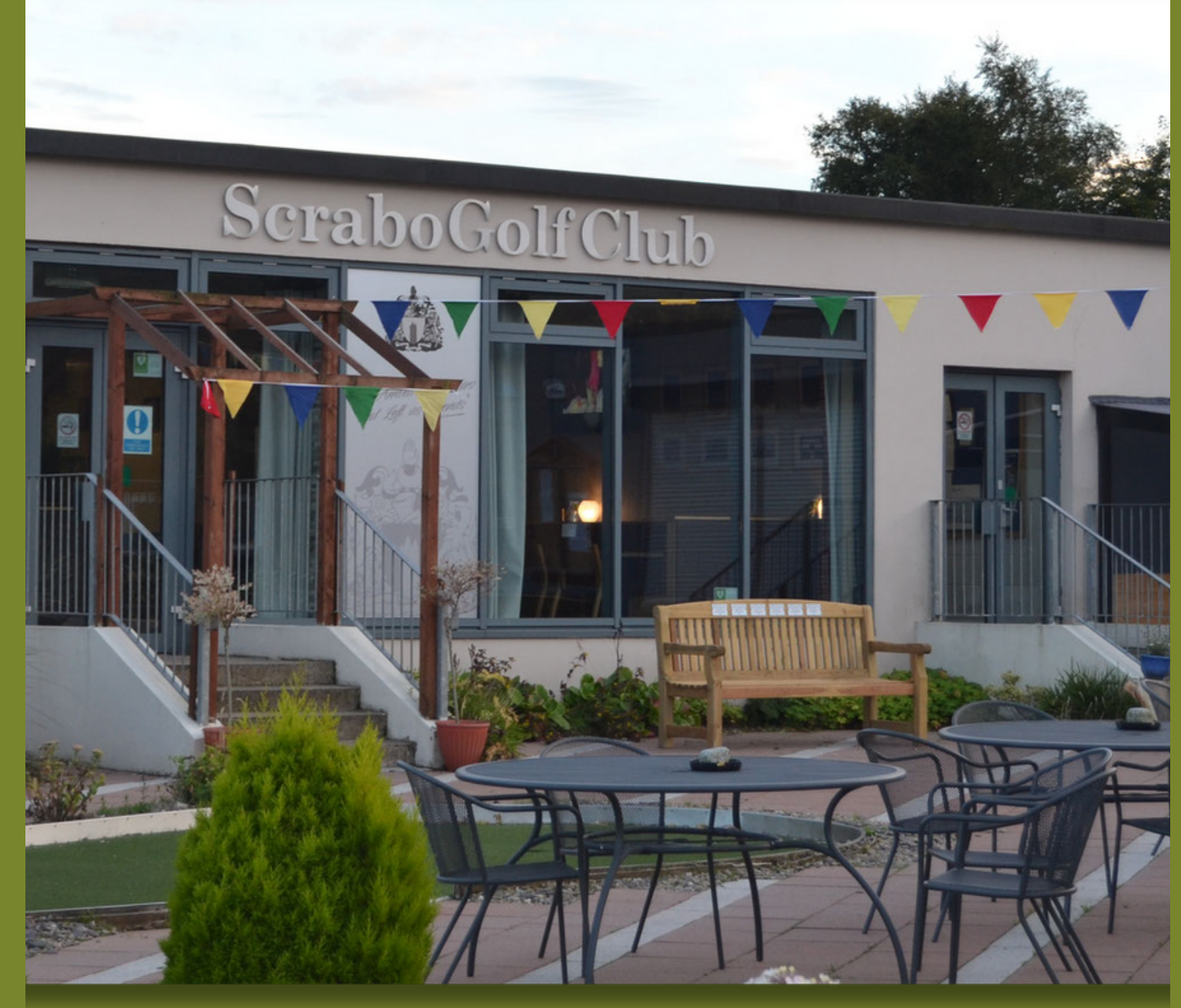
GOLF AND FOOD OPTIONS AND COSTS